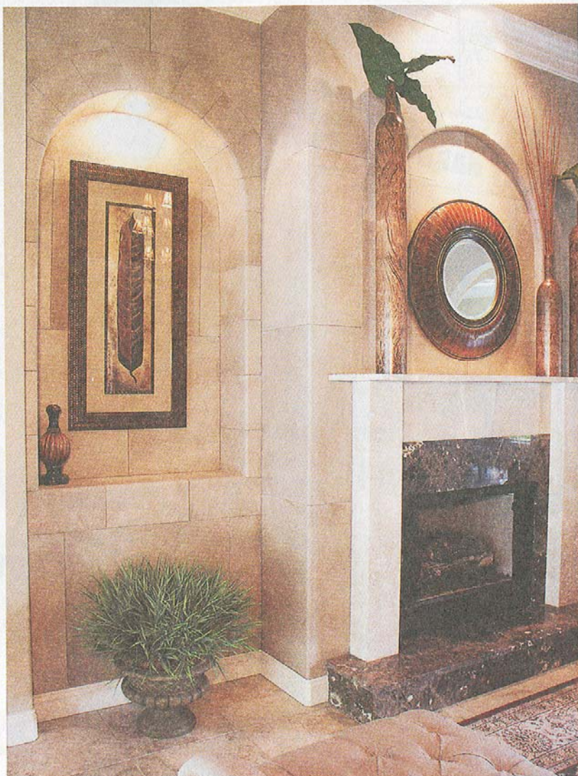
Above: Weathered Stone of Florida will show off a stone replica product, one of many products that will be on display at the Expo.

The event is presented by the Home Builders Association of West Florida and sponsored by the Pensacola News Journal, WEAR TV 3, Pensacola Home & Garden magazine and Energy Services of Pensacola.