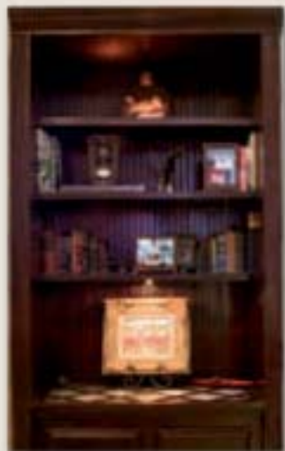
Bookcase Units Stained Dark Walnut