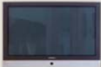
Flat Screen Television