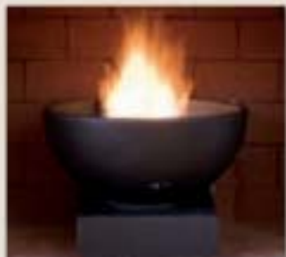
Firebowl by Spark Modern Fire